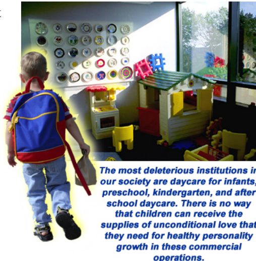
The most deleterious institutions in our society are daycare for infants, preschool, kindergarten, and after school daycare. There is no way that children can receive the supplies of unconditional love that they need for healthy personality growth in these commercial operations.

One of the tragedies of the cultural change is that the birthrate has decreased precipitously. It is now less than the replacement rate. Evidence of this is in our neighborhood. Many of the older persons have moved away, replaced by young professionals. When we first moved here, the neighborhood was full of children. People got out on summer evenings and walked with their children or took them to the neighborhood park. Now we see them walking their dogs carrying their pooper-scoops. One or two children are the rule if they have any. In our young years, it was three or more. Of course, we came along after the end of the war, and did not have the pill. During the war, women entered the work force. They continued to work after the war to educate the men who were